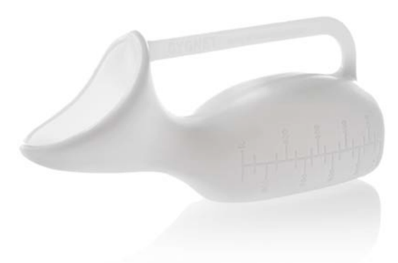
Female urinal bottle with handle.

Female users can sometimes find it more difficult than men to use these devices, but design improvements have reduced spills and leaks significantly. Flow can be controlled better on bottles that have a wider opening at the neck, allowing for the bottle to be angled appropriately once placed firmly against the skin.