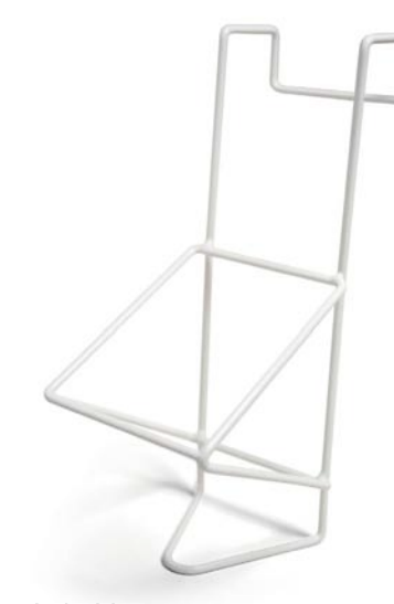
Hanging bottle holder.

If a urinal bottle is to be used whilst in bed or a wheelchair, you may want to store the urinal bottle within easy reach. In this case it is important to select a urinal bottle that is compatible with a bottle holder. Bottle holders are simple devices that securely hold the bottle within easy reach when not in use. They are ideal for hanging on a bedframe or wheelchair.