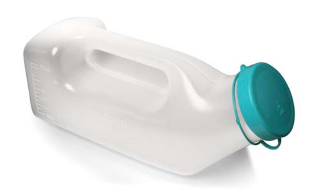
Plastic re-usable urinal bottle.

Many healthcare professionals today prefer to use hard-wearing plastic urinals. Plastic versions are lightweight and easy to handle strong, warm to touch, comfortable to use, and low cost. The preferred plastics are polyethylene (HDPE) or polypropylene (PP) for strength, durability and low cost. Polyethylene urinals are often favoured for personal use at home as these can simply be washed with water and detergents. Polypropylene products tend to be preferred in hospitals due to its ability to withstand the high washing temperatures required by hospital standards.