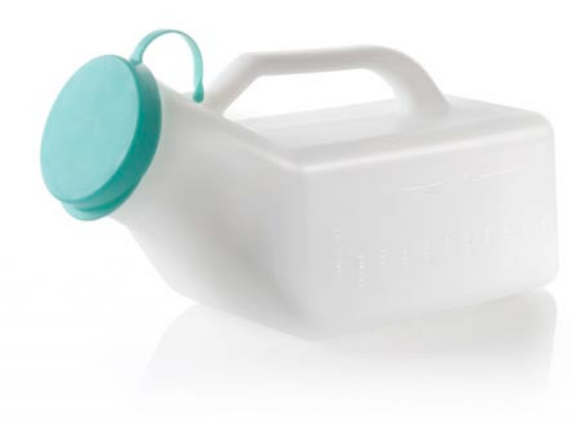
Male urinal bottle with handle.

The urinal bottle is the best option in comparison to a bedpan for men when urinating, irrespective of whether the user is upright or lying down. Most male handheld urinal bottles are very similar in size and shape with a narrowed opening at the 'neck' of the bottle.