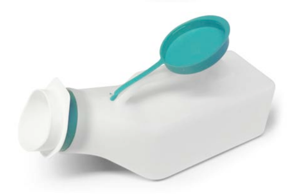
Male urinal bottle with compatible non-return valve.