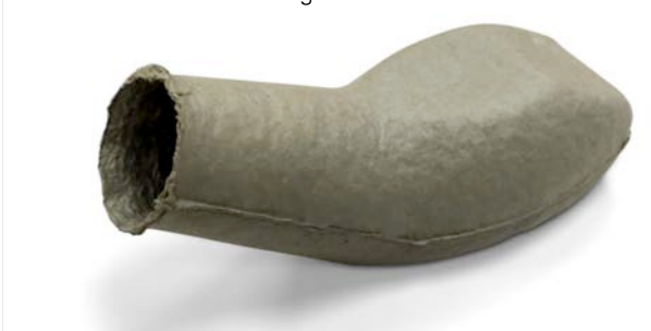
Pulp paper disposable urinal bottle.

Stainless steel urinals can be cold to touch and use, heavy to handle and noisy to use. They are also expensive to purchase and can sometimes cause irritation to the skin. Disposable versions may be suitable for short-term use or if you don't want to worry about cleaning and washing. However pulp-paper products will need specialist handling and disposal so are best suited to hospitals and nursing homes that can dispose of them in line with clinical waste regulations.