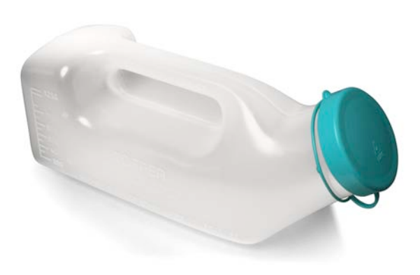
Flat bottomed bottles are more stable after use.

Urinal bottles should be smoothly shaped and fit comfortably between the legs. Look for designs with easy to hold handles if you have limited hand movement. Flat bottomed bottles are more stable and less likely to spill. Urinal pans can be heavy to carry when full and if hand control is restricted, then the user may need assistance to empty the pan.