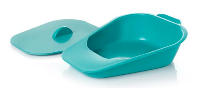
Female urinal slipper pan.

Slipper or petal pans are commonly used by females in a sitting position as an alternative to a urinal bottle.