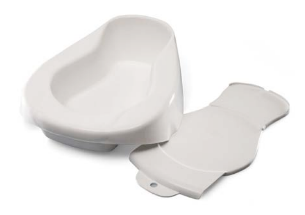
Plastic re-usable bedpan.

Many healthcare professionals today prefer to use hard-wearing plastic bedpans. Plastic versions are lightweight and easy to handle, strong, warm to touch, comfortable to use, and low cost. The preferred plastic material is polypropylene (PP) due to its strength, ease of handling, and its ability to withstand the high