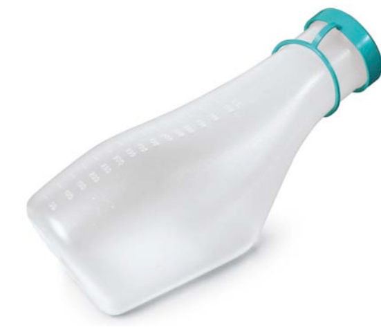
Male urinal bottle without handle.