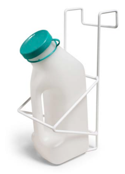
Urinal bottle in hanging bottle holder.

Warwick SASCo has been manufacturing and supplying polypropylene medical devices for over 30 years. Our expertise in medical plastics has led us to be recognised as the market leader in medical polyware in over 65 countries around the world.